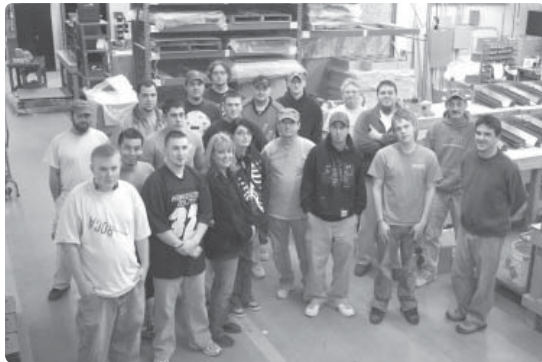
2 nd Shift Final Assembly

We start with flat sheet metal and after this department has cut, punched, bent, welded, and painted we have the beginnings of our final products. Boiler vessels are welded together using our robotic welder; components are installed by members of this crew and then the vessels are pressure tested to meet ASME requirements.