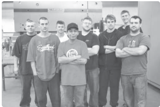
2 nd Shift Sheet Metal

When we saw the increased sales coming in, we began a second shift in mid-July. Searching the globe, or Minnesota, we found additional workers to produce, quality check, and package the products that are in high demand.